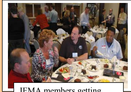
IFMA members getting To know each other